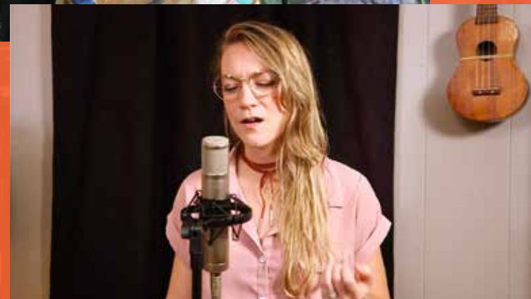
ARTIST: LAUREL MINNES - MINUSCULE