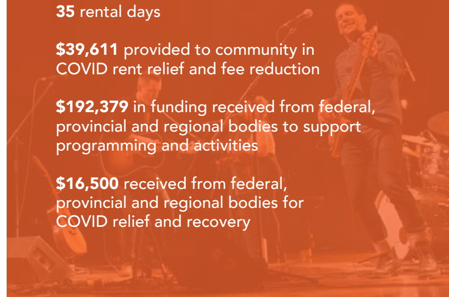
ARTIST: ROYAL WOOD

$16,500 received from federal, provincial and regional bodies for COVID relief and recovery