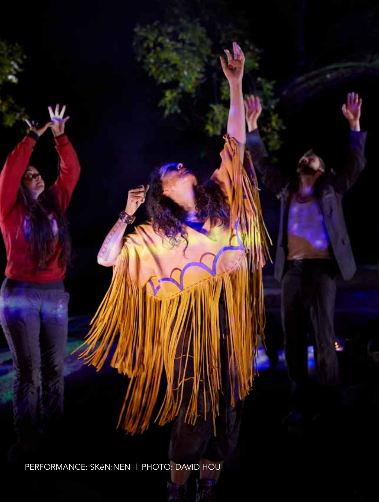
PERFORMANCE: SKÉN:NEN | PHOTO: DAVID HOU