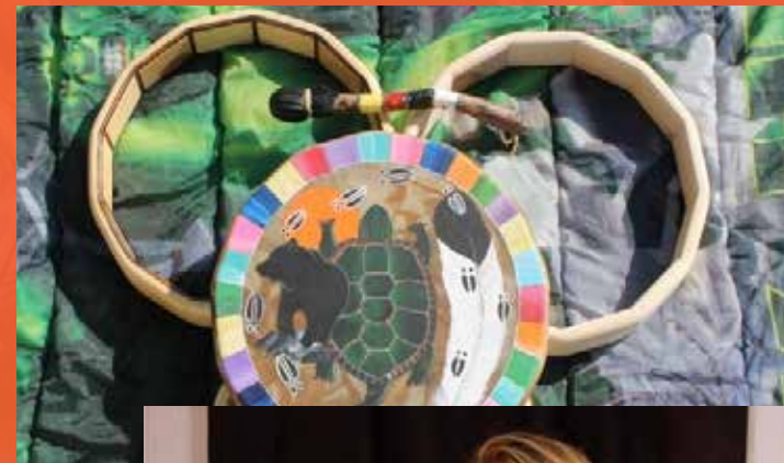
ARTIST: 101 DEWEGUNS