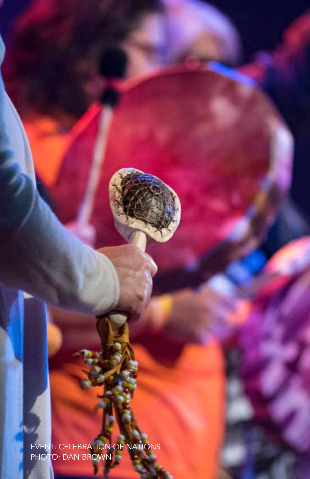
EVENT: CELEBRATION OF NATIONS